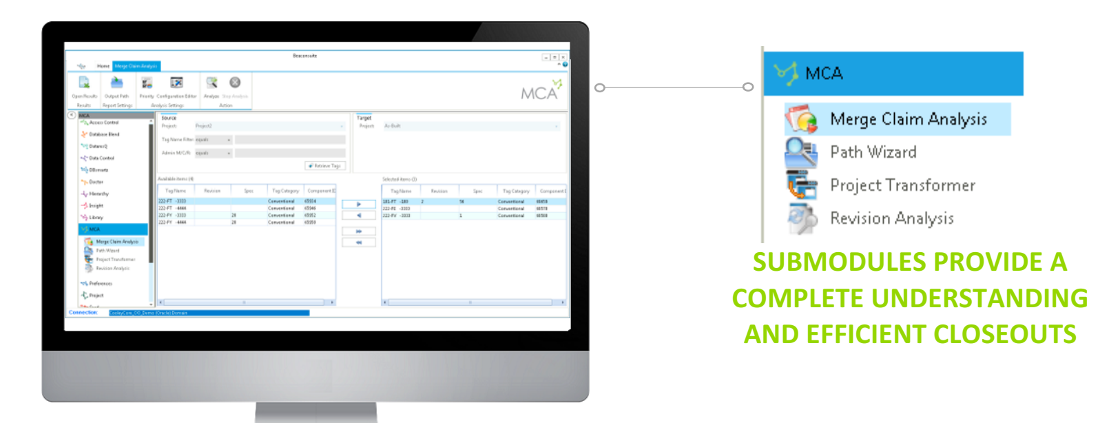
Visually see source, target and future state