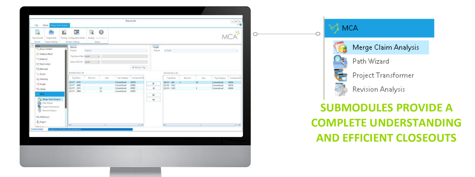
Visually see source, target and future state information